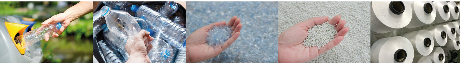
Collection of PET bottles «post-consumer»